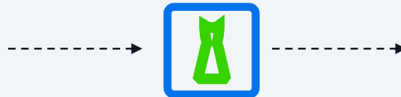
Build the Look App